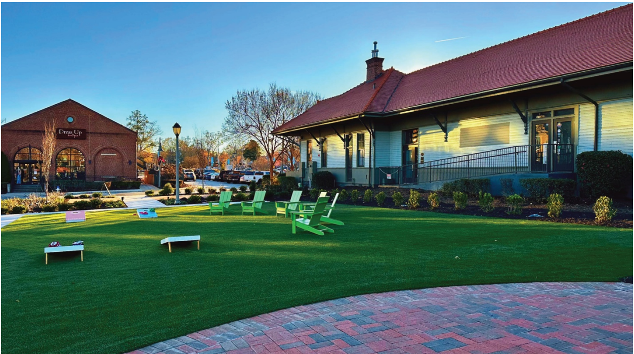
Slide: Depot Square

In April, we finally broke ground on this generational opportunity, and with the help of our private sector partners, we are well underway. We have completed the extension of Chambers Street to Arnold Mill Road and cut the ribbon on Depot Square, a brand-new public gathering space between the new development and our historic Freight Depot.