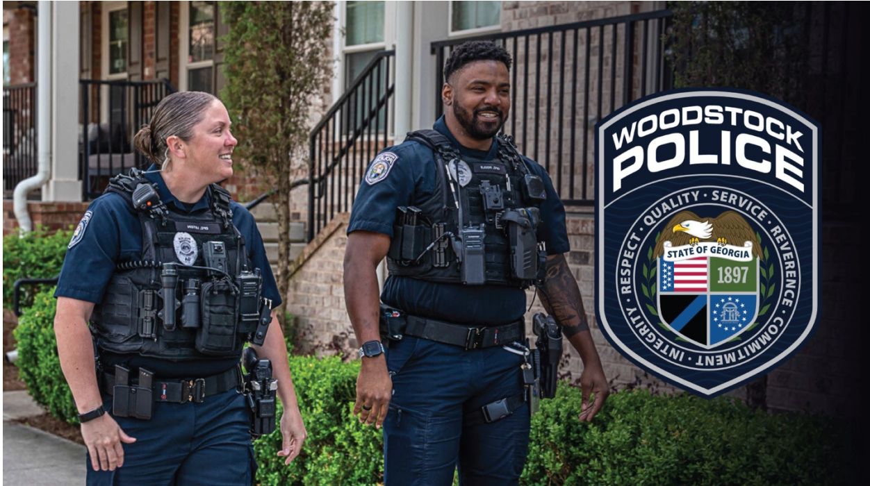
Slide: Woodstock Police Officers

is crime. As crime rates have spiked in cities across the nation over the past several years, the simple truth is that our neighbors still do not feel as safe as they did several years before.