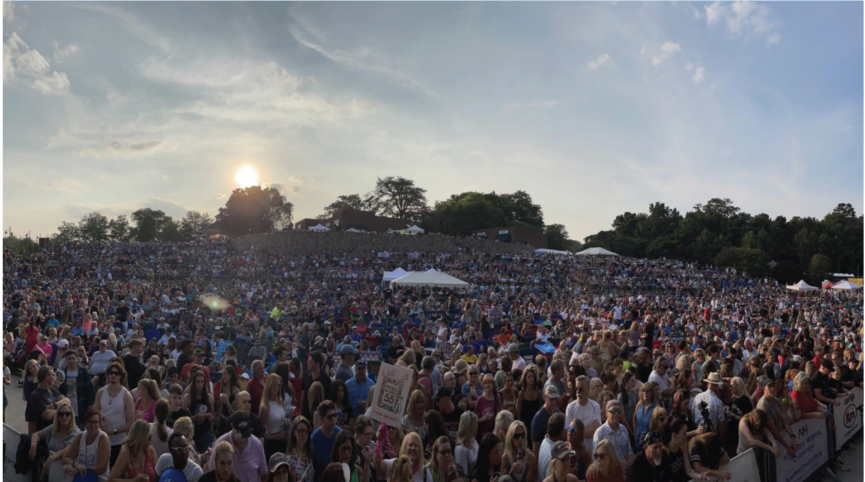
Slide: Audience at the Rick Springfield concert in 2023

Our Parks and Recreation team does so much for us. Thanks in many ways to their efforts, this city presents some of the best outdoor events and concert offerings in the region. If you haven't joined us for our Summer Concert Series yet, you're missing out. With more than 14,000 people in attendance at just one of our shows last year, this is a city that doesn't miss a party. And for the moment I know many of you come to this speech for, I'm excited to announce our 2024 lineup for the first time publicly: