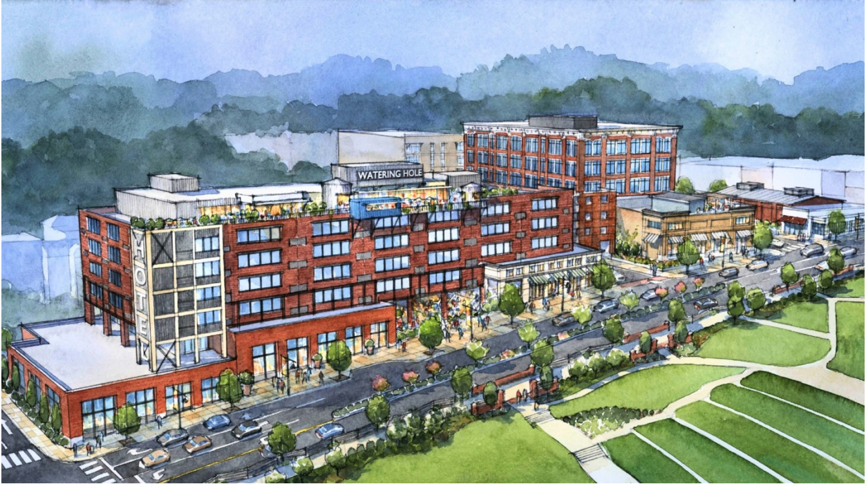
Slide: Rendering of Woodstock City Center

In April, we finally broke ground on this generational opportunity, and with the help of our private sector partners, we are well underway. We have completed the extension of Chambers Street to Arnold Mill Road and cut the ribbon on Depot Square, a brand-new public gathering space between the new development and our historic Freight Depot.