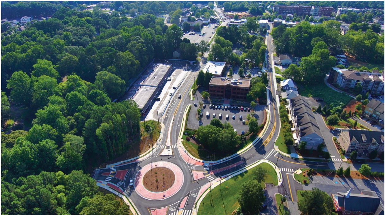
Slide: Towne Lake Pkwy/Mill Street roundabout

Our city continues to rank among the most visited downtown destinations in the southeastern United States. Having been named - just in the last year - among WalletHub's Best Small Cities in America, Southern Living's Prettiest Small Towns in Georgia, and HOMEiA's 10 Best Places to Live in Georgia 2024 - Woodstock continues to attract people looking for an incredible place to live and raise a family from all around the nation. In 1990, our city had roughly 4,500 residents. Today, we stand just shy of 40,000 Woodstockers and rank the 20th largest city in Georgia.