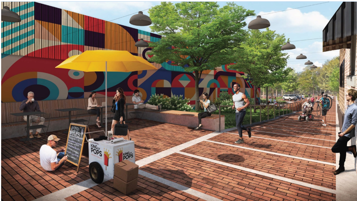
Slide: Pedestrian plaza rendering