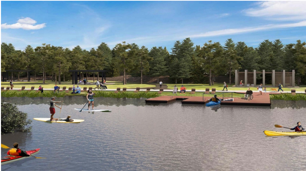
Slide: Rendering of the future Little River Park

Nearly a decade ago our Council acquired and assembled more than 100 acres of land stretching from Trickum Road, winding along both shores of Little River down to the Woodlands neighborhood on Highway 92. This expansive natural area more than doubled the amount of Woodstock-owned green space, and the Parks and Recreation Advisory Board and the City Council adopted plans to develop the space into a newly envisioned Little River Park. Little River Park will include miles of paved, boardwalk and natural trails, playgrounds, pavilions, fishing, outdoor learning space, greenspace, disc golf, hiking trails, a park office, visitor center and will tie into our master trail system. This is a best-in-class park offering unlike anything existing north of the perimeter today.