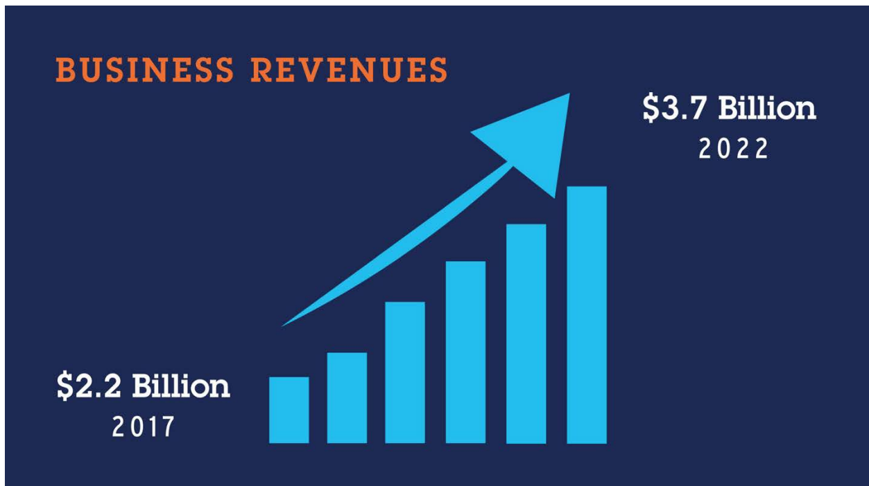
Slide: Business Revenues

The foundational structure is being laid for the public parking deck and the remainder of the private development now. The project is projected to complete with hotel construction wrapping up in just a few short years, the majority of the restaurants, retail and office completing in late 2025, and the parking deck is slated to open before the end of this calendar year.