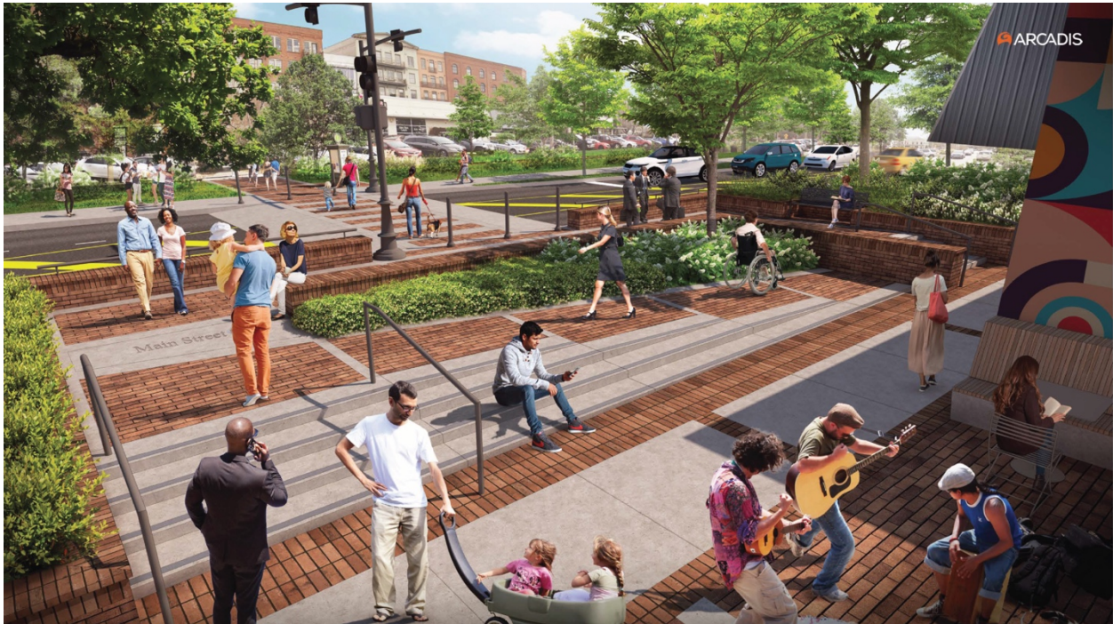
Slide: Pedestrian plaza rendering

Among the largest remaining causes of traffic in downtown Woodstock are the large number of pedestrians crossing Main Street at multiple intersections - some of which are timed, some of which are lit, some of which are frogger-style free-for-alls. We are designing a conversion of the Elm Street corridor to a pedestrian plaza which will align with our primary crosswalk on Main Street. Once complete, we will divert crossings to this central location.