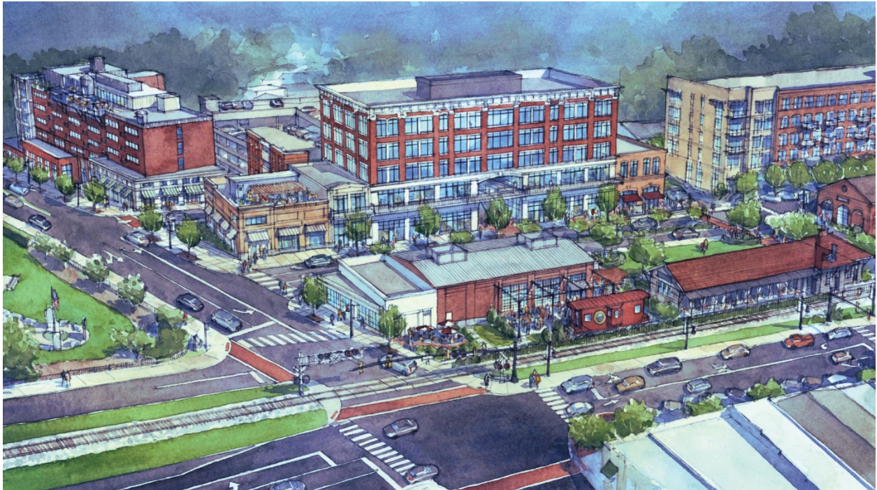
Slide: Rendering of Woodstock City Center

We have continued to make progress on my second major priority of building a stronger commercial base and recruiting new, high-paying jobs into our city as well. Our City Center development represents a major investment in both our city's infrastructure and the next generation of our city's economy.