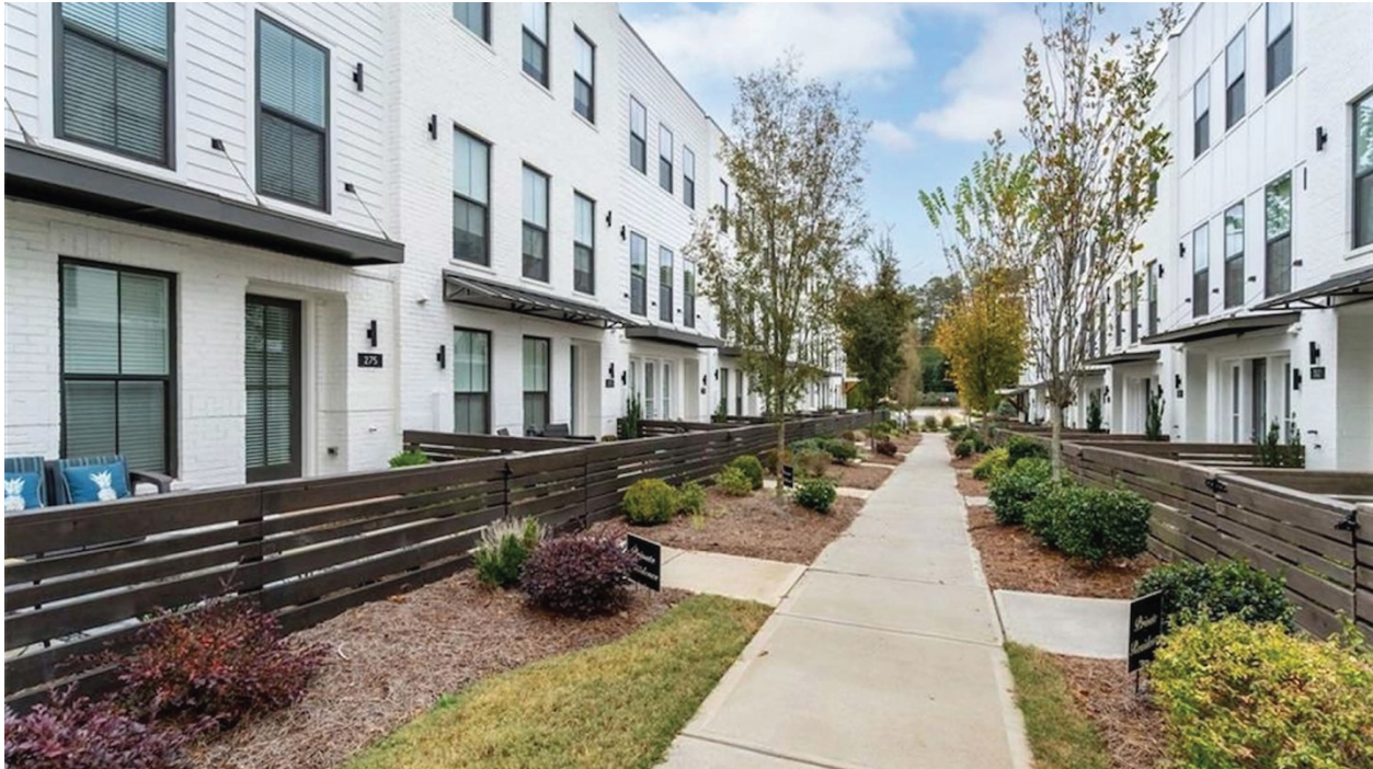
Slide: Townhomes in Woodstock

The third priority of my administration has been making the American dream of home ownership available to more of our citizens. As we look forward to the state of our city for the next generation, we look back to find the success factors that gave our nation the largest middle class in world history. With housing prices skyrocketing, interest rates at generational highs, and a housing inventory more limited than ever, we are watching the erosion of the bedrock of our middle class.