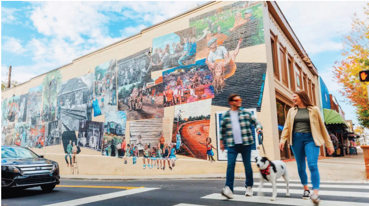
Slide: Downtown Woodstock