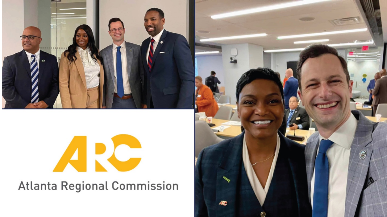
Slide: Mayor with other Officers and Executive Director of Atlanta Regional Commission

who own a business in a county south of here because that was the place to be two decades ago, give me a shot. Coffee's on me. This is where you want to be.