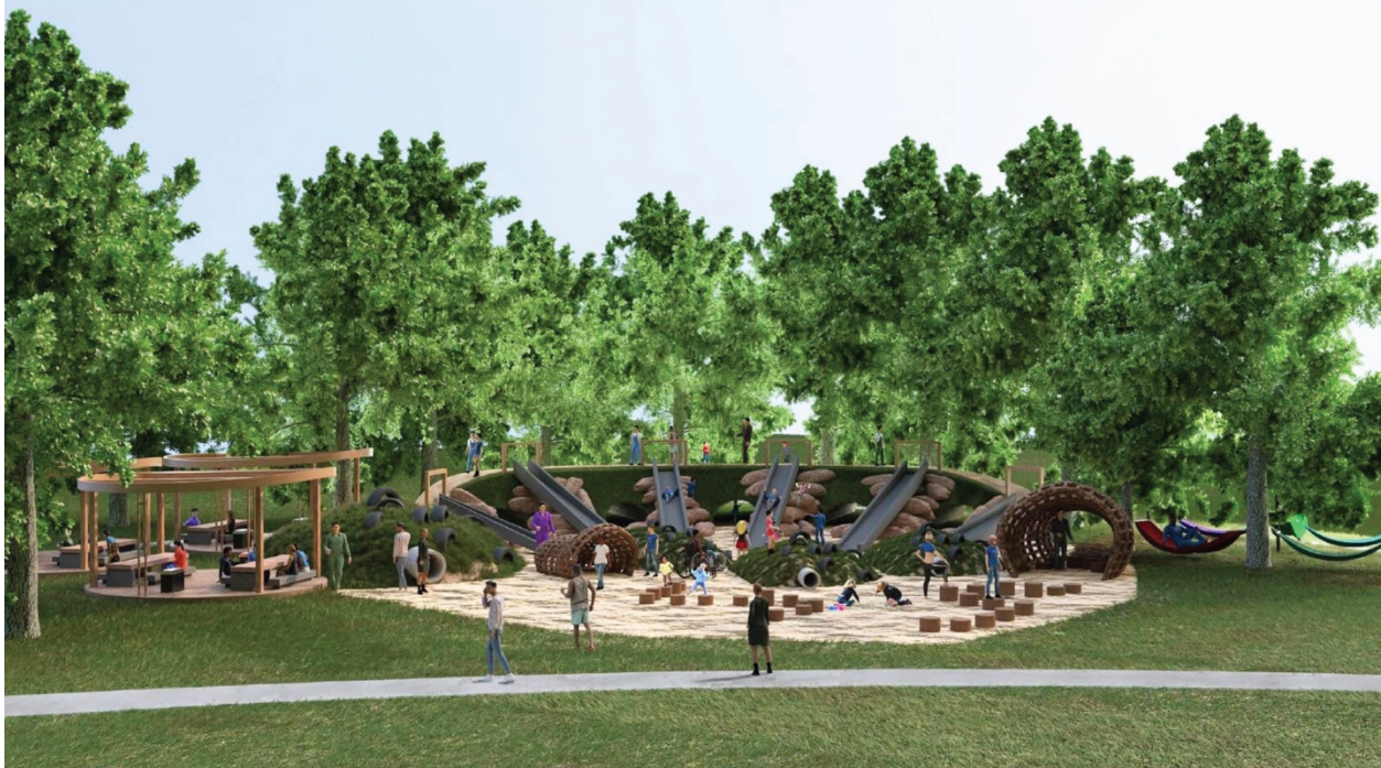
Slide: Rendering of the future Little River Park playground

This referendum represented the largest single investment in Woodstock's parks in our city's history. Woodstock's voters approved the measure with an 87% majority, the largest majority I have ever seen for a referendum of any kind in this state. On the same day, another major suburban city here in the metro Atlanta area saw its voters reject a parks bond referendum. Our citizens were clear: the completion of this park and the expansion of our trails is a central priority for Woodstock.